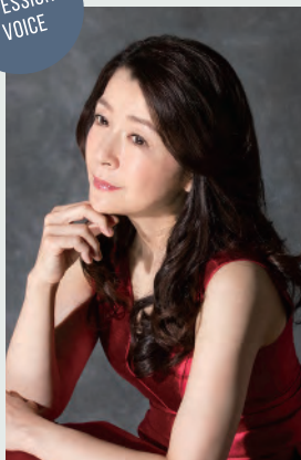
ピアニスト 仲道 郁代 氏