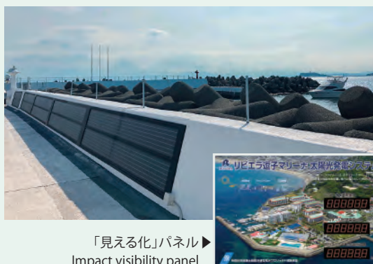
「見える化」パネル Impact visibility panel

We are the first in Japan to install 5kW thin-film solar panels along our breakwaters. To contribute to the more widespread adoption of renewable energy, we are working on making its impact visible by displaying figures indicating the amount of energy generated and reductions achieved in CO 2 emissions.